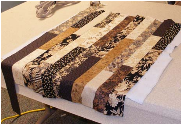
Sample photo 1 Sweatshirt back using 2 ½” strips in brown and tans