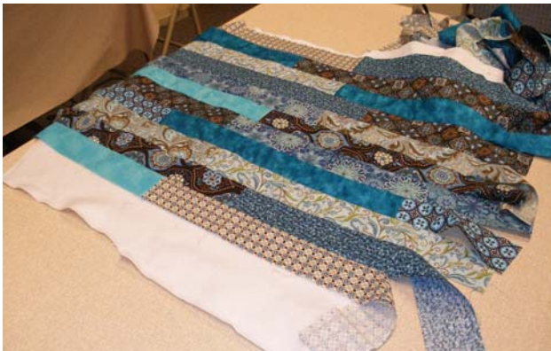
Sample photo 2 Sweatshirt back using 2 ½” strips in turquoise and browns